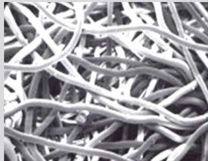
2.25 denier polyester fiber