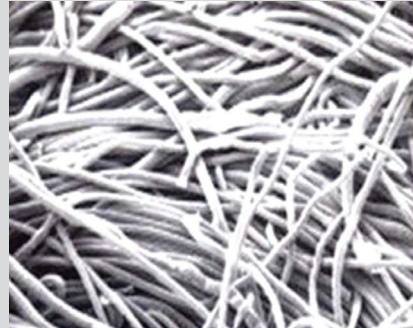
DYNA-MAC 0.7 denier polyester fiber

Less cleaning means reduced consumption of compressed air. Therefore, switching from regular felt bags to DYNA-MAC felt lowers operating costs and increases profits.