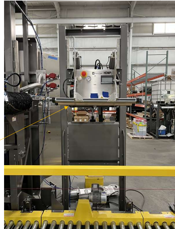
Bag Sealing Station