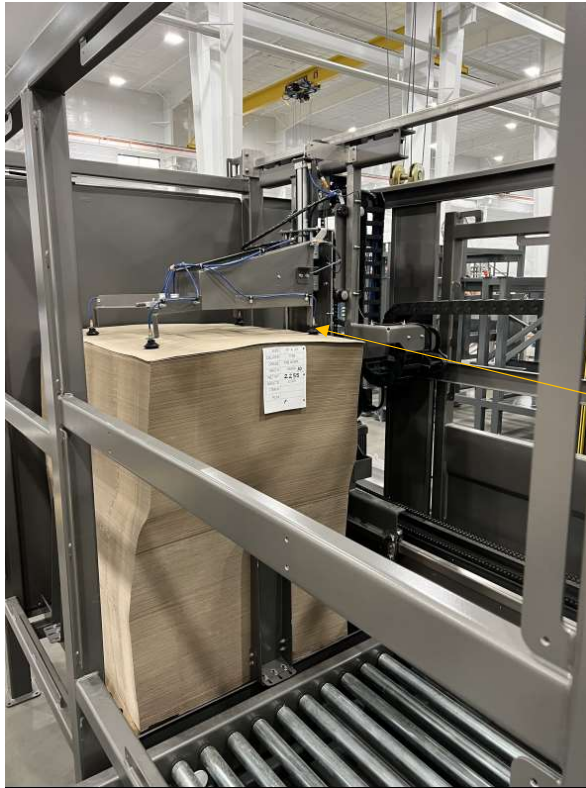
Slip Sheet Dispenser