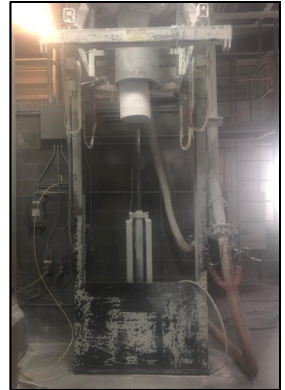
Existing Bag Fill Station. The Portable Drum Filler is manually position & connected to the Bag Filler.