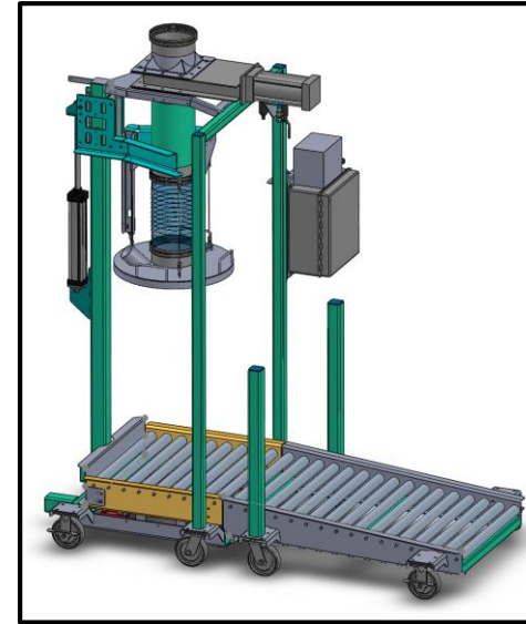
SolidWorks 3D equipment model

Portable single drum fill station designed to integrate with the current bulk bag filler. An operator will manually position the drum filler under the existing Bulk Bag Filler. The equipment includes independent pneumatic knife gate, drum filler controls with a load cell scale package. The controls will open and close an existing feed valve.