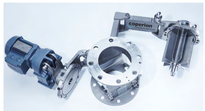
Coperion ZRD quick clean rotary valve with FXS extraction device