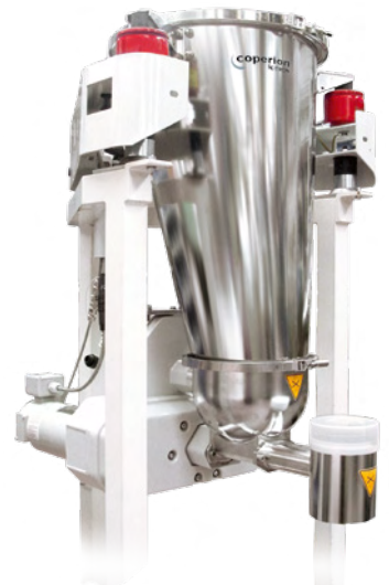
Coperion K-Tron weighing technology provides accurate feeding of valuable ingredients

Conversely, vacuum (negative pressure) systems are often used for lower volumes and shorter distances. One of the advantages of vacuum systems is the inward suction created by the vacuum blower and reduction of any outward leakage of dust. This is one of the reasons why vacuum systems are often used in dust containment applications. Another advantage