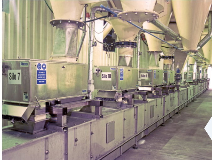
Weigh belt feeders control the flow of detergent ingredients into the process. Other belt feeders are used as bulk flow meters.

Detergent powders, tablets and capsules of different brands are generally packed in bags and boxes of different sizes.