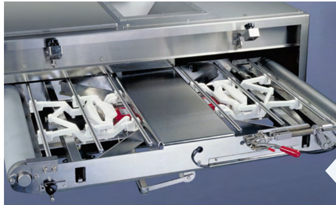
Conveyor with belt removed shows the two weigh modules which allow continuous online taring.