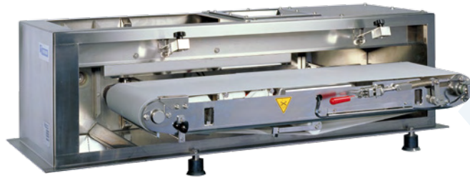
Smart weigh belt feeder with conveyor removed from the housing on the telescopic support for easy cleaning or belt change.

The conveyor is removable from the stainless steel housing via a telescopic support structure. This facilitates thorough cleaning of the feeder.