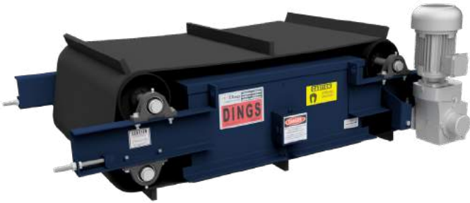
Dings MRF (Material Recovery Facilities) Overhead Electromagnet