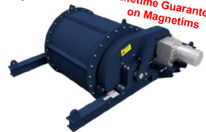
Deep Draw Drum