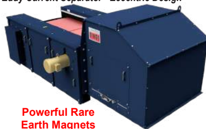
Eddy Current Separator - Eccentric Design