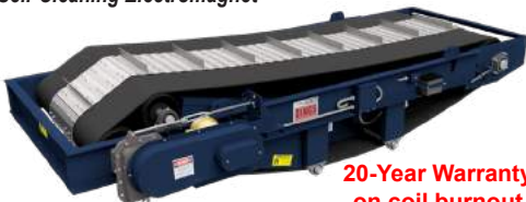
SWMS (Solid Waste Management System) Overhead Self-Cleaning Electromagnet