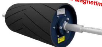
Magnetic Head Pulley