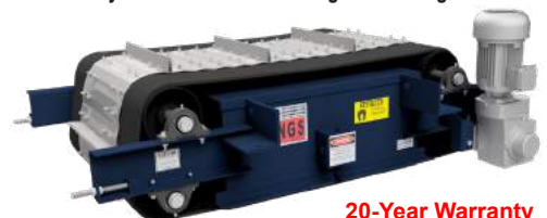
Severe-Duty Overhead Self-Cleaning Electromagnet