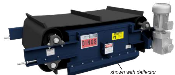
Dings MRF (Material Recovery Facilities) Overhead Electromagnet

● Call Us For Expert Support of Dings Co. Magnetic Group Equipment - Regardless of its Age