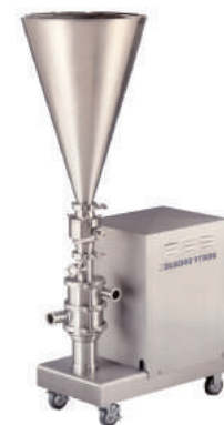
Quadro Ytron® Powder Dispenser