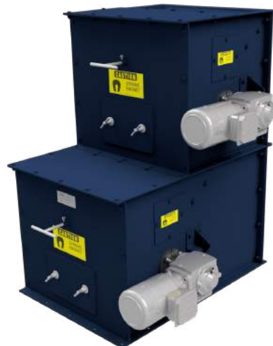
Dings Magnetic Drum Type FC - double configuration shown