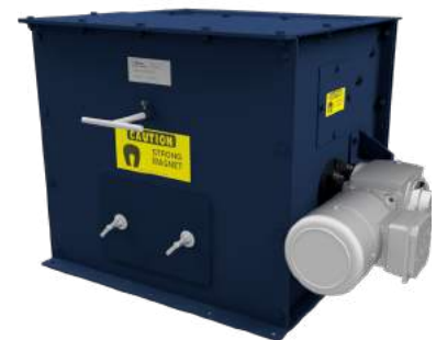
Dings Magnetic Drum Type FC (drum and housing) shown

● Call Us For Expert Support of Dings Co. Magnetic Group Equipment - Regardless of Its Age