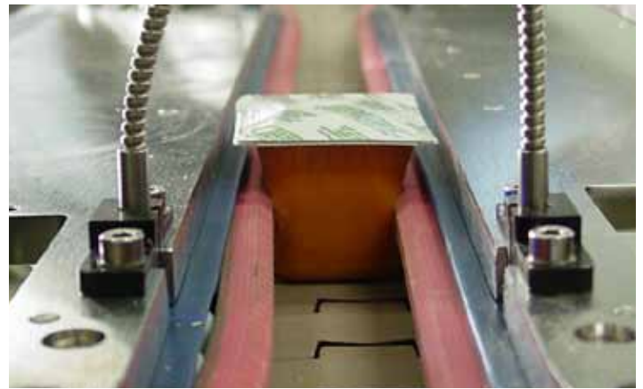
View of sample in the Dual Sensor Compression LP system. Note the opposing low profile 12mm belts.

Test results achieved in the test laboratory may be different from results seen in the production environment.