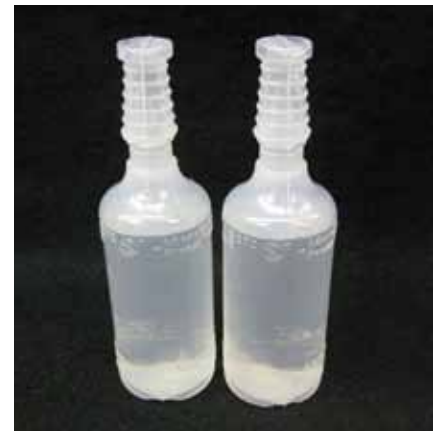
Flexible containers (pharmaceutical saline) also suitable for inspection on the T4000-DSC-LP.

Teledyne TapTone has modified the inspection capabilities of its most popular T4000-DSC system with a Low Profile (LP) transport deck that is designed to meet the challenges of testing these smaller, low profile packages for leaks.