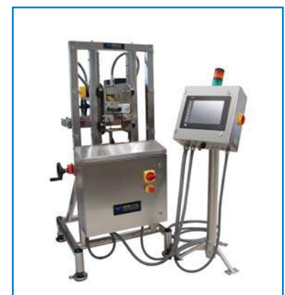
T4000-FS Force System. All stainless steel construction and highly sensitive pressure detection make it the perfect solution for testing low pressure PET bottles.

Detects leaks and low pressure in aerosol containers, LN2 dosed beverage containers, and carbonated beverage containers. Parallel belts transport the container past a sensor that measures the tension on the sidewall of the container. This action allows the system to measure the pressure inside the container. Utilizing DSP technology, the controller analyzes the measurement and assigns a merit value to each container. If the merit value is outside of the acceptable range, a reject signal activates a remote reject system.