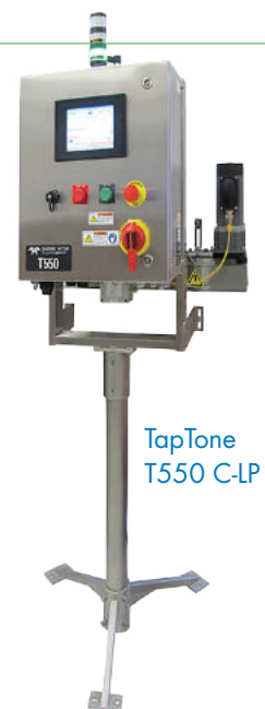
TapTone T550 C-LP

The T550 Compression System with Top Down Load Cell (TDLC) technology - finds and rejects leaking and damaged flexible coffee pods at production line speeds up to 300 feet per minute. By squeezing the container sides to create head pressure, doming of the foil or plastic seal is created permitting measurement of leak sensor merit values from above. Utilizing DSP technology, the controller analyzes the measurement and assigns a merit value to each container. If the merit value is outside of the acceptable range, a reject signal activates a remote reject system. This innovative TapTone design takes product inspection to a new level by offering customers the ability to meet the demand of leak detection in smaller, low profile style products.