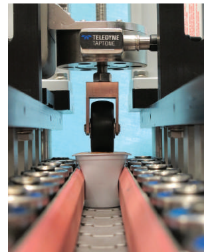
Single size pod samples (coffee) being tested in T550 C-LP w/TDLC.

The T550 C-LP sensor with TDLC worked well on these style coffee pods. The T550 C-LP sensor with TDLC was able to detect a leak size of 0.008" and larger through the container and membrane closure. Testing at higher production speeds may result in a variance of minimum leak sizes. The T550 C-LP sensor with TDLC sensor can be recommended for the inspection of most single serve coffee pod applications.