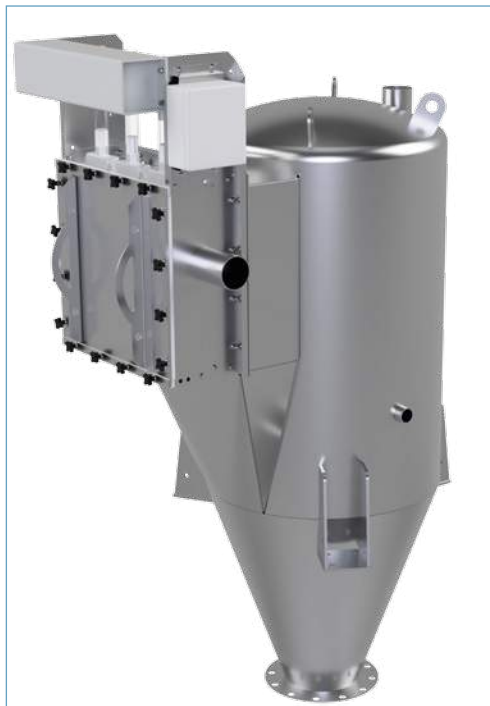
Fig. 2: Side Access Filter Receiver

Depending upon the volumes required, possible sources of ingredient delivery include boxes, sacks, bulk bags or super sacks. Pneumatic conveying systems can be used to transfer these ingredients in all steps of the process, utilizing either positive or negative pressure dilute phase conveying. Positive pressure conveying systems are typically used to transport bulk materials over long distances and at high throughputs. Applications which involve pressure conveying often include loading and unloading of large volume vessels such as bulk bags. Conversely, vacuum (negative