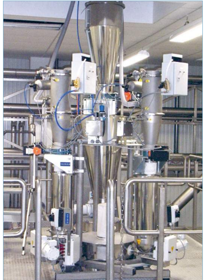
Fig. 4: Gain-in-weight batching system in a food application

LIW batching utilizing Coperion K-Tron high accuracy screw feeders such as those shown in Figure 4 provides a significant accuracy and process time advantage over traditional GIW batch techniques. LIW batching is used when the accuracy of individual ingredient weights in the completed batch is critical or when the batch cycle times need to be very short. Gravimetric feeders operating in batch mode simultaneously feed multiple ingredients into a collection hopper. Adjustment of the delivery speed (on/off, fast/slow) lies with the LIW feeder controls and the smaller weighing systems deliver highly accurate batches for each ingredient. Once all the ingredients have been delivered, the batch is complete and the mixture is delivered to the process below. Since all ingredients are being delivered at the same time, the overall batch time as well as further processing times downstream are greatly reduced. This method of batching is often used for high value ingredients due to the highly accurate requirement of their weight in the mix as well as their ingredient cost.