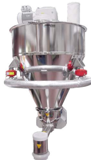
Fig. 6: T60 twin screw loss-in-weight feeder

For additional information and application information on extrusion, feeding and material handling for all pet food and pet treat processes, see www.coperion.com/food .