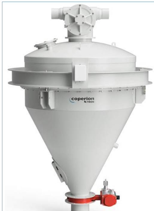
Fig. 3: Scale Hopper with Aeropass Valve at top

For additional information on pet food conveying methods, see our Technical Paper T-900011 'What Is the Best Pneumatic Transfer Method for My Pet Food Process'.