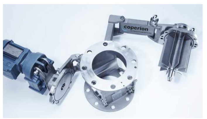
Coperion ZRD rotary valve with FXS extraction device