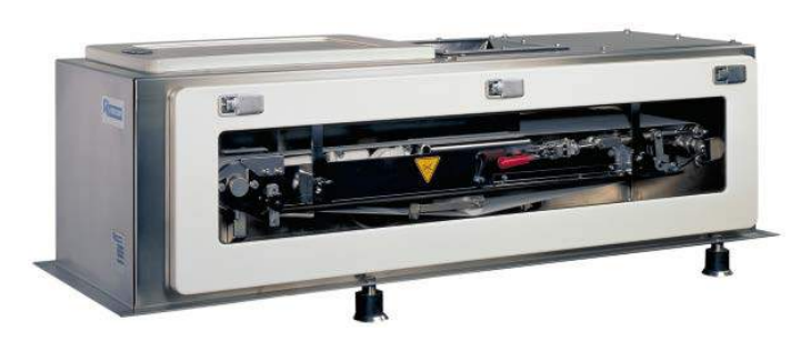
Coperion K-Tron Smart Weigh Belt (SWB) feeders are available in closed frame (shown) or open frame models.