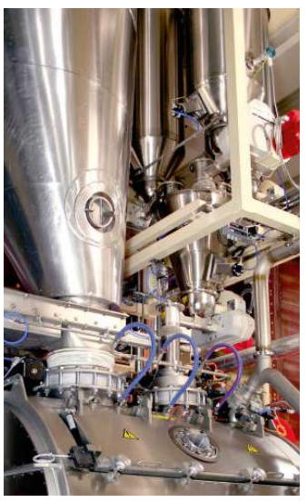
Coperion K-Tron screw feeders in a vacuum coating process