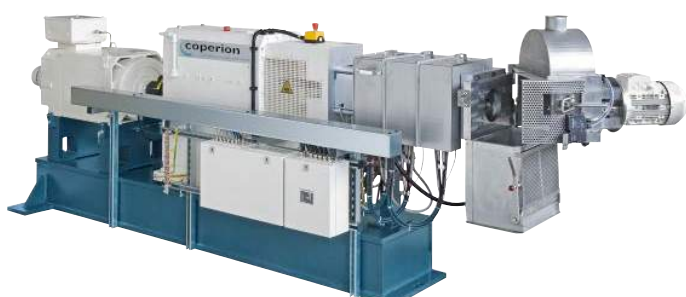
The Coperion ZSK MEGAvolume PLUS is especially suitable for the economical processing of dry and semi-dry dog and cat food and treats.

After all ingredients have been fed into the extruder, they must be mixed homogeneously. Usually this can be done by one or more mixing zones, which consist of combinations of different