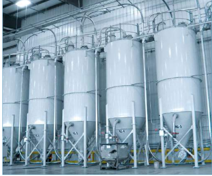
Coperion K-Tron pneumatic conveying system

In-line or off-line screeners are often used during the raw ingredient transfer process for