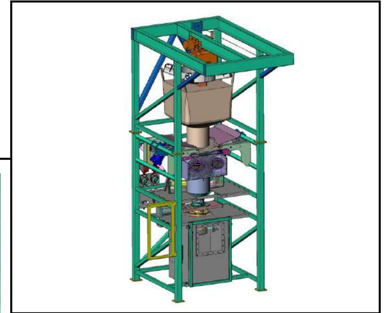
Glove Box with E3 and Drum Filler